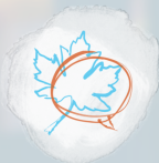
Canadian University Society for Intercollegiate Debate